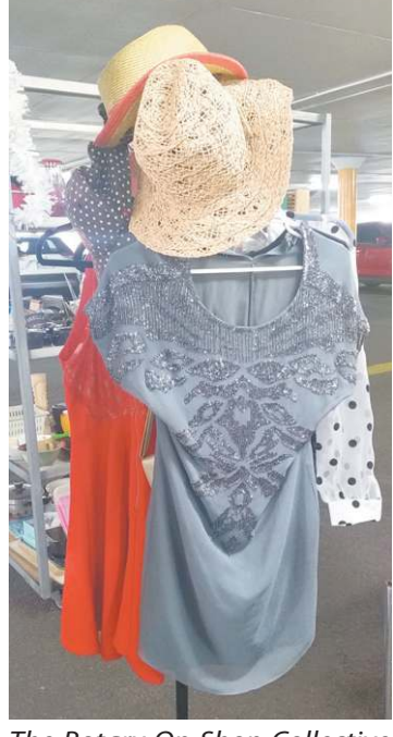
The Rotary Op Shop Collective in Broadway Fair Shopping Centre, Nedlands, opens every Sunday until Christmas Eve.

Collective is staffed by volunteers from the Rotary clubs of West Perth, Matilda Bay, Subiaco and Western Endeavour and all proceeds go to Rotary projects.